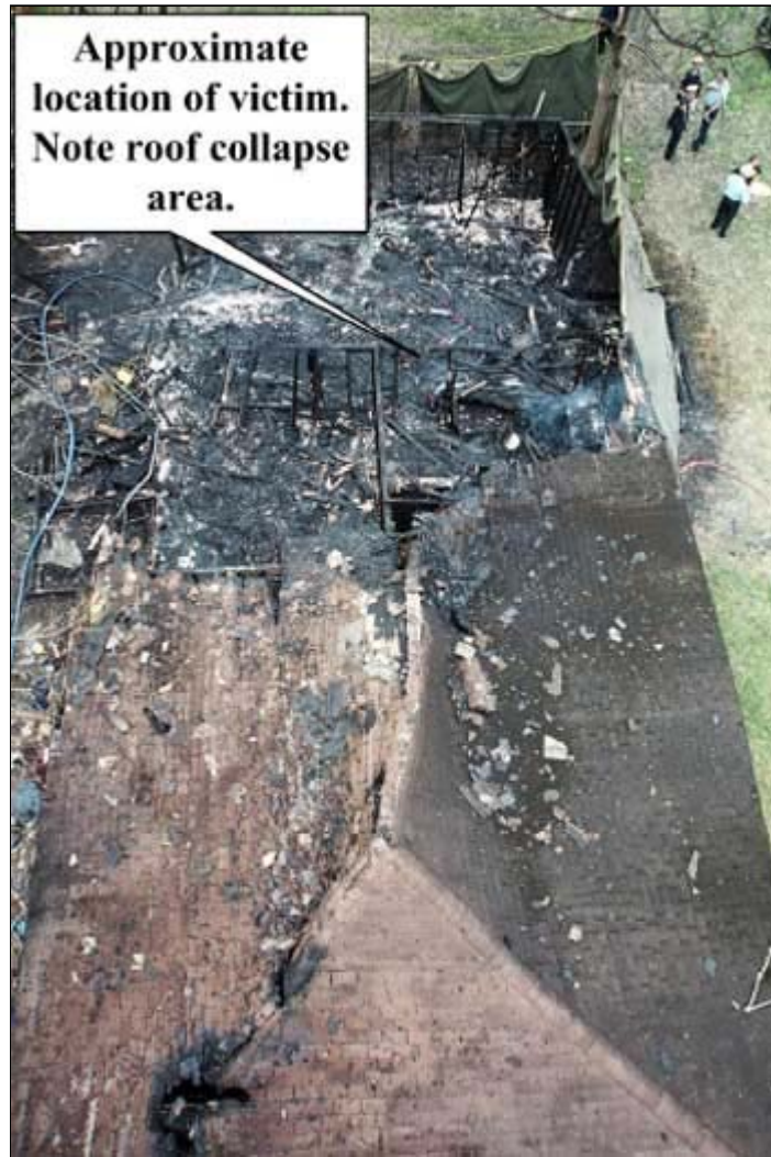
Photo 4. Aerial view of collapse zone.