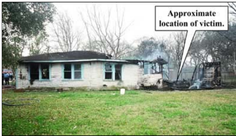
Photo 3. Note roof collapse area at rear of house.