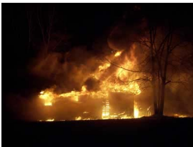
Photo 2. Taken just prior to, or near the time, of the collapse. See Photo 3 for the same view after fire extinguishment.