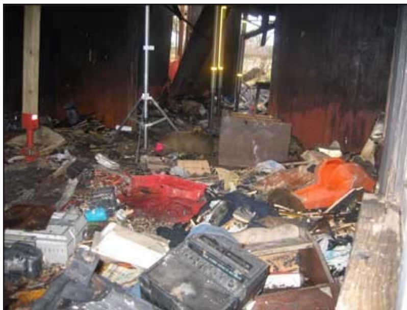
Photo 1. Note cluttered condition of floor in living room.