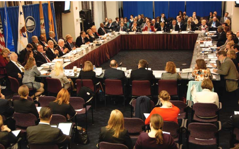
Photo of a meeting of the NCFS, 14

As a federal advisory commission, the work and meetings of the NCFS require transparency. Thus, its meetings must be open and available to the public. Approximately 100 members of the public attend each of its four meetings a year. Meeting agendas, videos, and written summaries of its meetings are posted on the NCFS website.