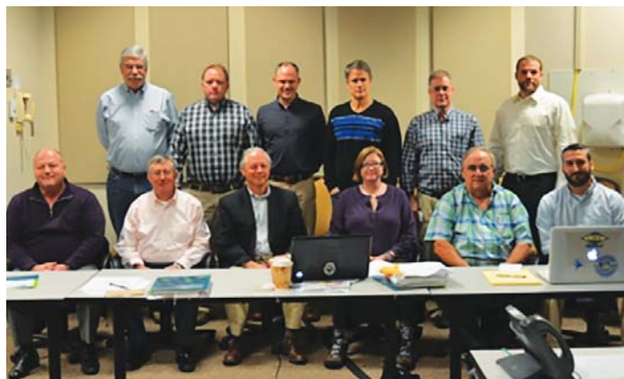
Photo of the Fire and Explosion Investigation Subcommittee and invited guests, taken at OSAC’s meeting in Leesburg, VA, January 2016 available at http://www.nist.gov/forensics/osac/sub-fire-scene.cfm.