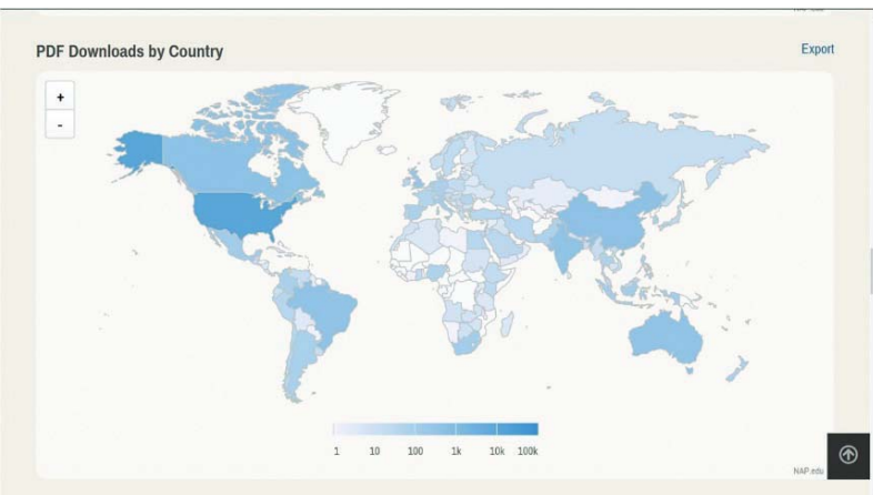
Figure 4: PDF Downloads of Strengthening Forensic Science in the United States: A Path Forward (2009) as of March 2016.

Insofar as some of the issues addressed in the report relate to the administration of justice, it is no surprise that the NRC/NAS Report is receiving attention in other common law jurisdictions with a legal system similar to that in the United States. These jurisdictions include England and Wales, Canada, and Australia, as one can see from the map in Figure 4.